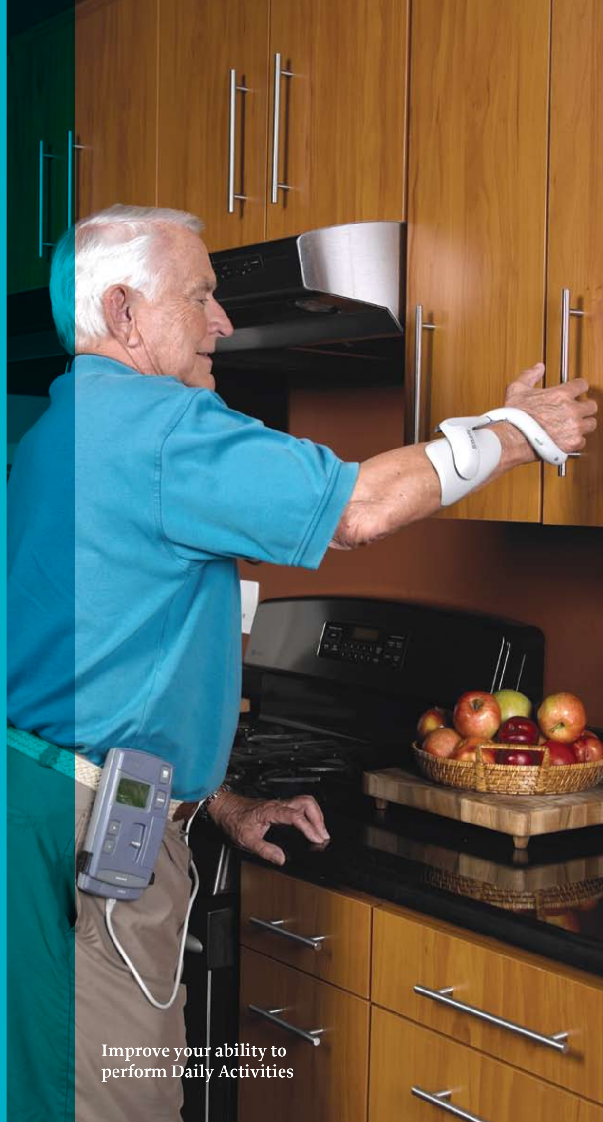
Improve your ability to perform Daily Activities

Another study suggested significant improvement in the ability to perform daily activities in addition to improved hand function. 4