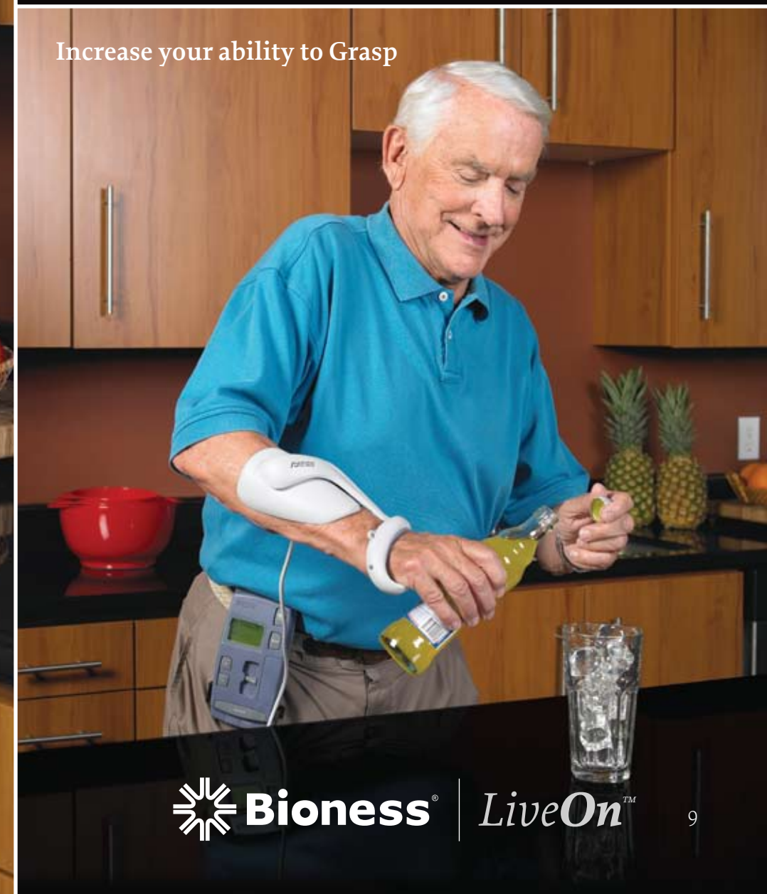
Increase your ability to Grasp